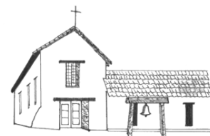
MISSION SAN FRANCISCO SOLANO